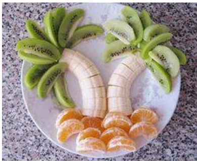
Dessert Island Fruits!

Snacks can be fun and involve children using chopping, peeling and arranging fruits and other snack food. Supervise children if using a sharp knife to chop up foods.